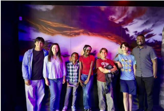
MAGPRES YOUTH MINI-GOLF & ESCAPE ROOM OUTING APRIL 2026

I tell you that you are Peter. And I'll build my church on this rock.