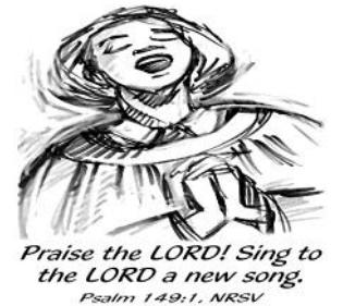
Praise the LORD! Sing to the LORD a new song. Psalm 149:1, NRSV

Come join the Choir! We meet Wednesday Nights at 7:00pm in the Choir Room located in the Church Office.