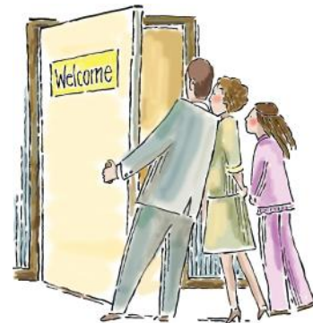
New Member Class