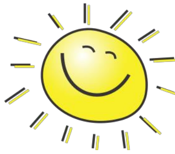
PHOTO DIRECTORY UPDATE