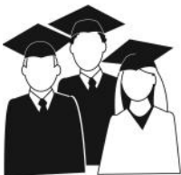
Graduates and Virtual Graduates